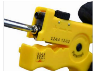
Quick & easy blade replacement by removing a single screw.

For more information or to locate the nearest authorized Ripley® distributor, please visit www.ripley-tools.com or call 1 (800) 528-8665 to speak to a customer service representative.