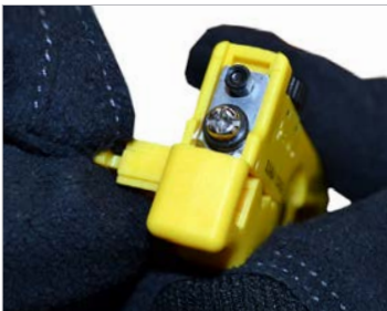
Reversible V-block fits cables ranging from 0.05" to 0.25" (1.2 to 6.4 mm). Safety tab on block reduces risk of accidental injury from blade.