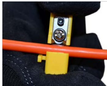
Reversible V-block provides optimal blade contact & stability during slitting operations.