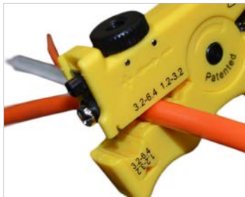
Compact design allows for cable ringing in tight, confined spaces.